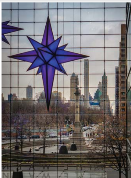
Christmas in NYC 2017 Columbus Circle Central Park South Rick Thau